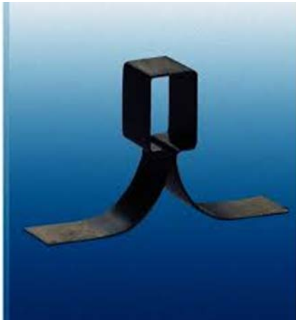
Figure 1 – Uplift Prevention Clips Details

The space above the panels and tiles shall not be used as an air circulation plenum.