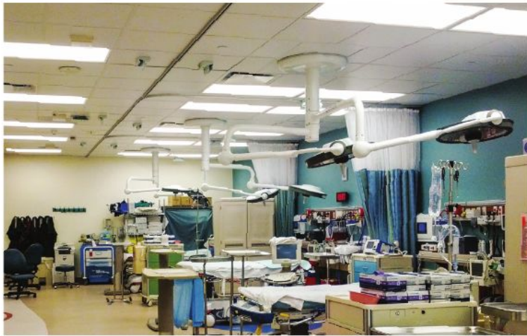
A trauma center, such as this one at Scripps Mercy Hospital in San Diego, may not need to meet the same stringent criteria as an operating room, but still needs a hygienic ceiling that can be easily cleaned and disinfected.