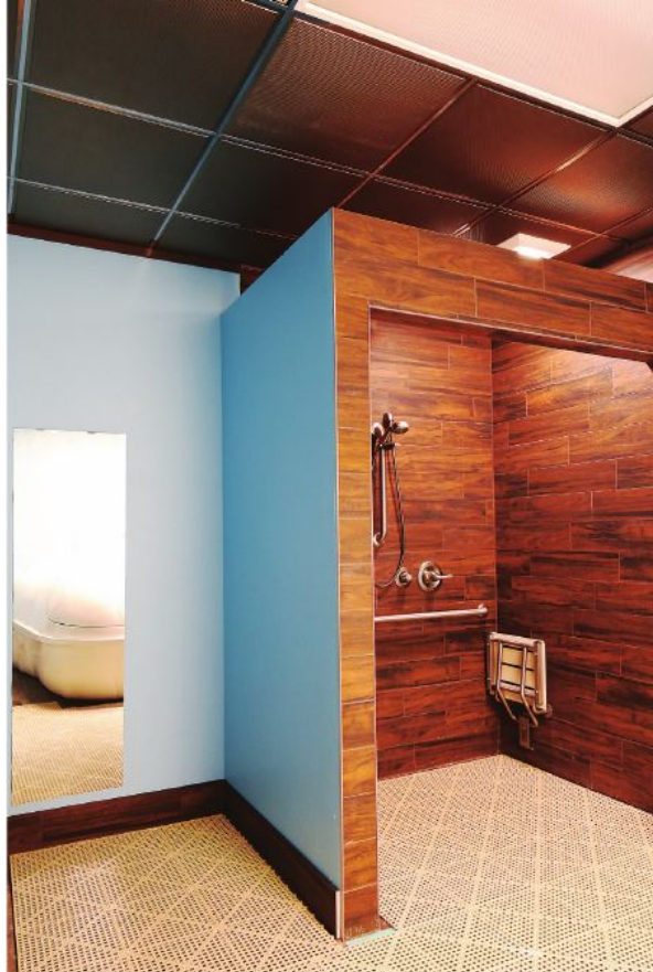
The high humidity often present in shower and locker rooms justifies the use of ceiling panels that will not support mold and can be easily cleaned.

Mineral fibers and inorganic filler in FRP are encased by polymer binders that reduce the release of naked fibers. Particulates can irritate eyes, skin, and the respiratory system, and chemicals in binders may be