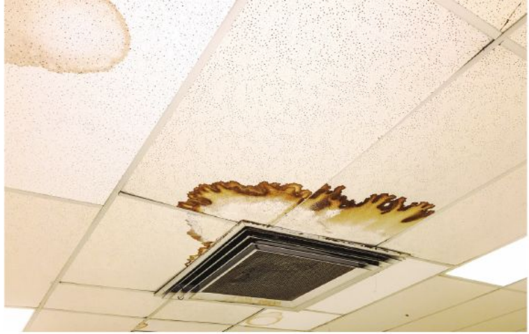
Some types of hygienic ceiling panels are immune to moisture-related problems such as these stains, sags, and mold growth.

Mineral fiber panels generally provide good acoustical properties, including noise reduction coefficients (NRC) and ceiling attenuation coefficients (CAC). They can also be used in floor-ceiling assemblies providing good