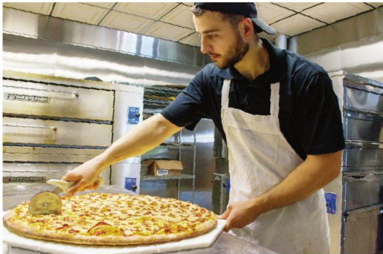
Although hygiene and safety have top priority, the owner of this pizzeria wanted an attractive ceiling, since the kitchen is visible from the dining room.