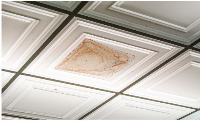
This luminous ceiling panel shows where leakage collected on the top side, then evaporated without damaging either the thermoformed panel or the contents of the room below. The stain was removed with simple washing.

One architectural response to infectious disease has been to specify products, including ceiling panels, with antimicrobial treatments. However, most authorities now recognize widespread use of antimicrobial products can ironically promote increased antimicrobial resistance in pathogens. In September 2016, the U.S. Food and Drug Administration (FDA) banned triclosan and 18 other antibacterial compounds from most consumer goods, saying ordinary soap and water is a healthier and safer way to decontaminate surfaces. 4 While the ban does not apply to building surfaces, the same logic does, suggesting specifiers give more attention to the intrinsic cleanability of products.