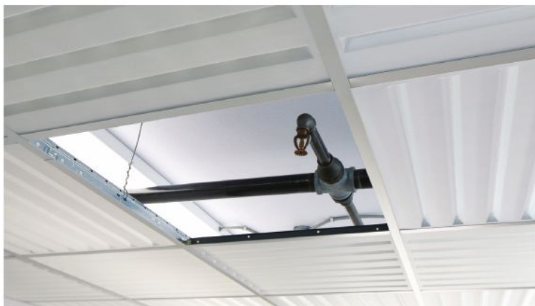
Installing drop-out ceiling panels beneath sprinklers and light fixtures keeps them out of a room's controlled environment.