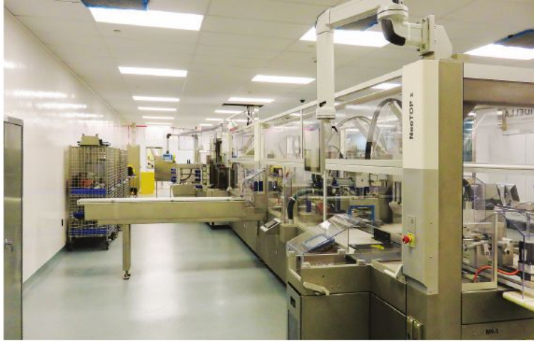
This fiber-reinforced plastic (FRP) ceiling was specified for a manufacturing space. The material offers hygienic advantages, but acoustic characteristics vary.