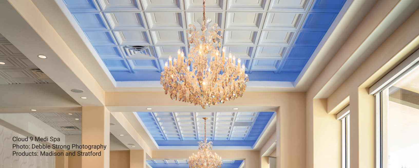
Cloud 9 Medi Spa Products: Madison and Stratford