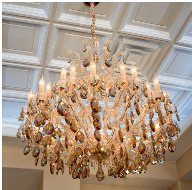
The deep relief ceiling adds elegance and a sense of grandeur that completes the statement of the chandeliers.