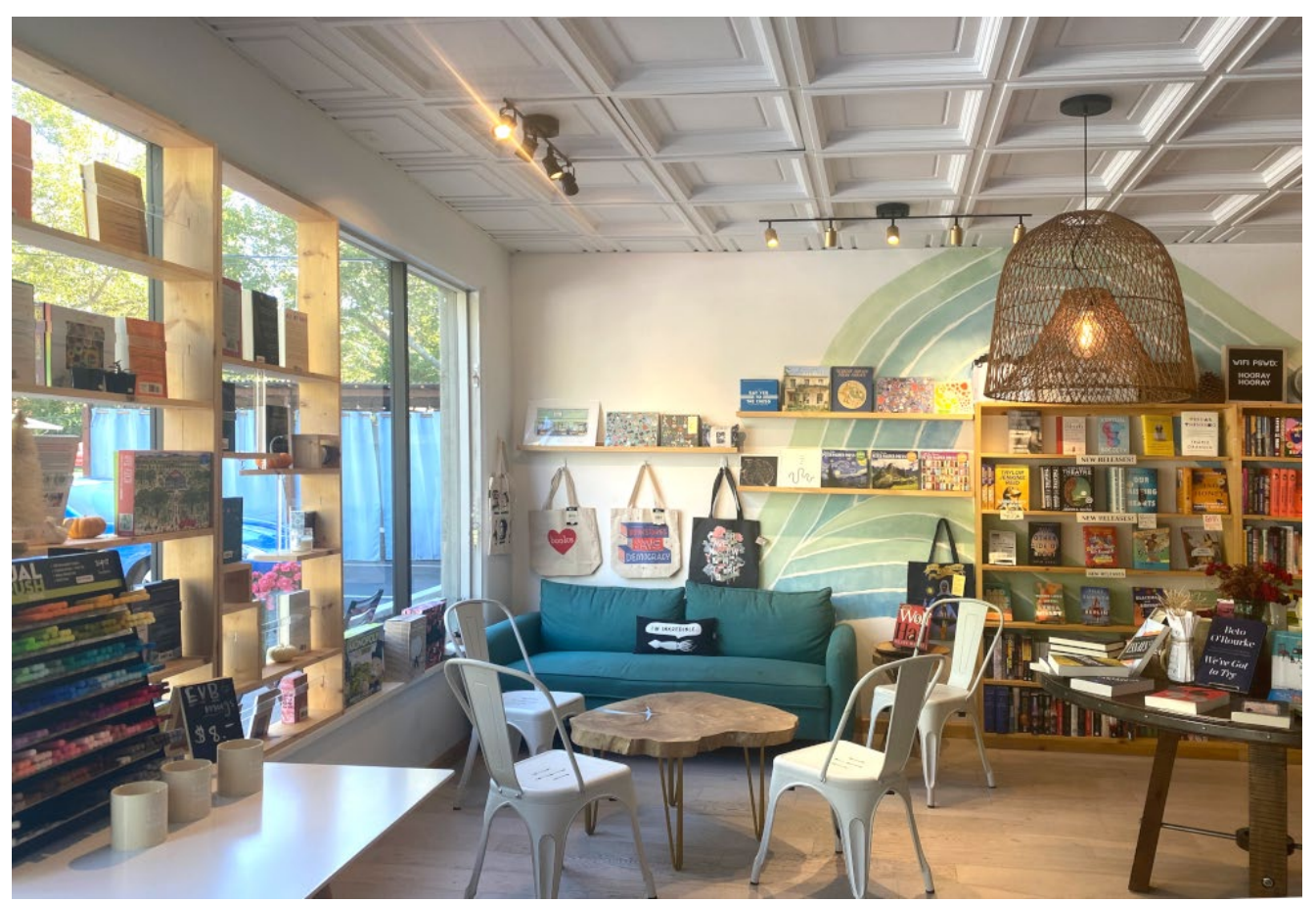
Border panels at the edges of the ceiling are a different pattern, Oxford, a shallower concentric square that mirrors the coffers but presents a profile that is more visually appealing when cut at the edges of the ceiling. Cutting is easy with a pair of snips.