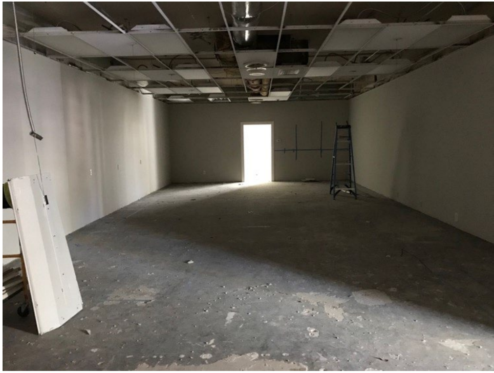
Before renovation, the ceiling was in in bad shape, with a warped grid and many missing panels. Replacing the grid proved inexpensive, and the owner was glad to be rid of the old flat ceiling tiles.