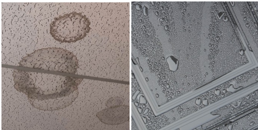
Left: Water can stain mineral fiber panels by leaching contaminants to the surface and supporting the growth of mold. Right: Thermoformed acoustic ceiling panels are impervious to water and water-borne stains.

Ceiling panels were tested in accordance with ASTM D1308 – Effect of Household Chemicals on Clear and Pigmented Organic Finishes. A small amount of each contaminant was placed on each specimen panel and allowed to sit for 16 hours before being wiped clean with paper towels and water. Visible stains were sprayed with all-purpose-cleaner, allowed to sit for several minutes, then wiped clean with damp cloth. Results show that Ceilume thermoformed panels resisted most stains while mineral fiber panels were stained by 13 out of 14 test agents.